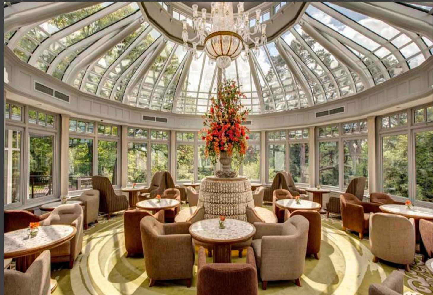
Day 3 – Overnight Stay at Galgorm Spa & Golf Resort